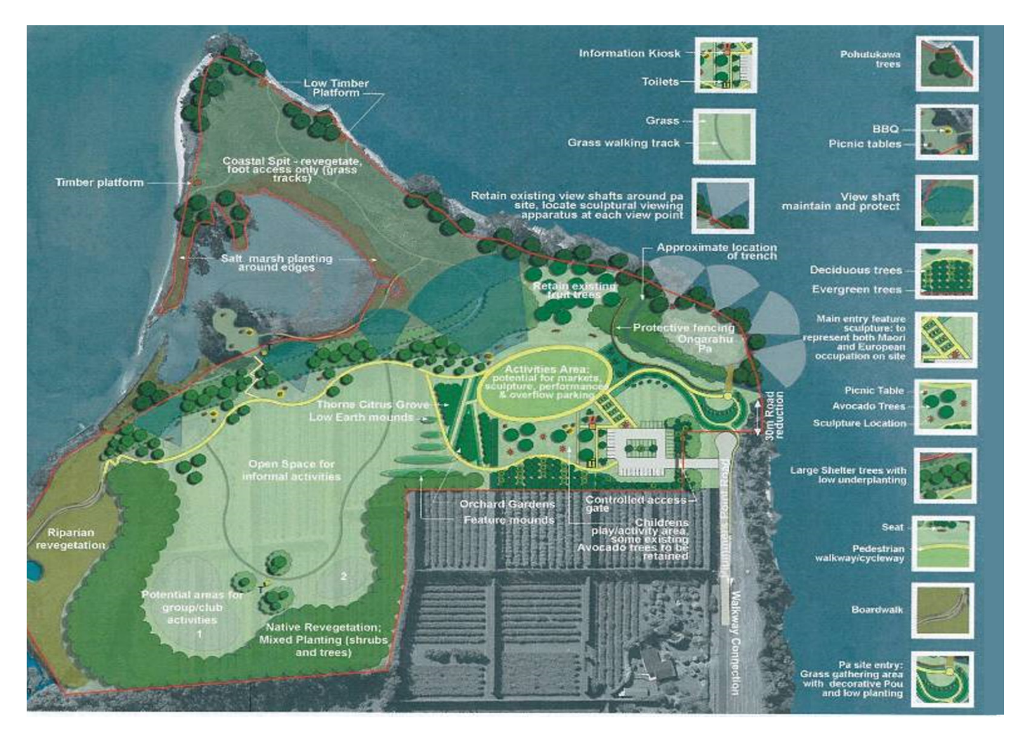
The Huharua Harbour Park, Tauranga special masterplan was created with the input from mana whenua, community and stakeholders. Case sudy image courtesy of Geoff Canham consulting.