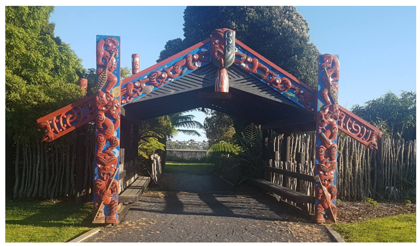
The grand entrance into the Ongarahu Pa, Huharua Park, Pirirakau Hapu and Western Bay of Plenty District Council.

The project is now known as an excellent example of mana whenua-community-council partnership of iwi leading the visioning process and business leaders partnering to implement, supported by council. The revitalised park has 12 km of shared trails, an entranceway to the city with large stands of kahikatea trees and entrance sculptures, extensive native plantings to enhance views, wetlands and aquatic life, passive and active recreational areas including trails, picnic facilities, and nature play areas. The collaborative restoration project has been <u>profiled internationally</u>.