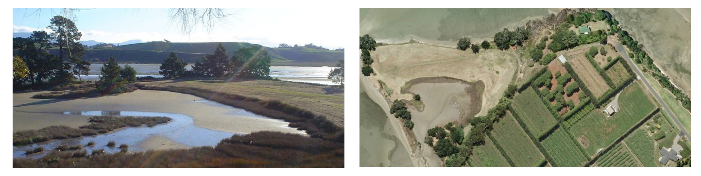
Site of Huharua Harbour Park, and the aerial view prior to orchard removal and other park developments.

The key works to redevelop and restore the park started in 2006 and finished in 2009. On one occasion community groups and schools planted over 8000 tress in just an hour. This included Pirirakau Hapu hosting an episode of 'DIY Marae' at the park where they reconstructed the Ongarahu Pa palisades and erected Waharoa and Atea features on the Ongarahu Pa. Collaborative planning meant the nature, style and form of recreation facilities were shaped by the people who would be using them. The Omokoroa-Tauranga cycle trail now passes through the park providing great access to the park. It has become a destination with features such as sacred trees and revealed archaeology, restored native habitat bringing birds, lizards and making the park a much more attractive place to picnic, play and spend time.