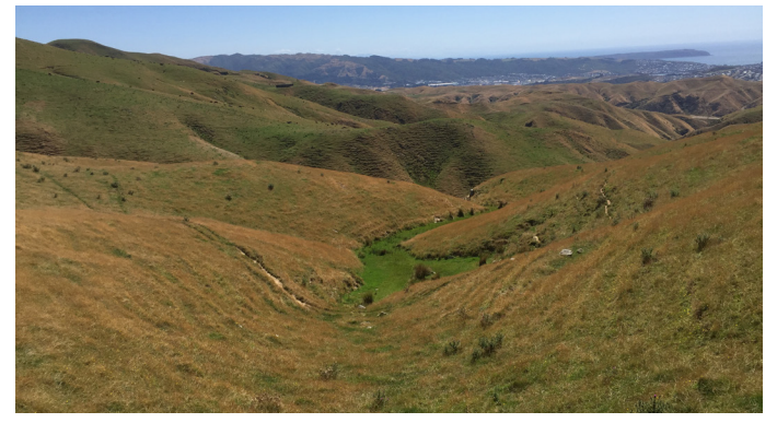
Some wetlands are 'seepages' and seasonal. To spot them, look for the different grasses and areas in gullies that still show green grass in the summer like this one in Belmont Regional Park.