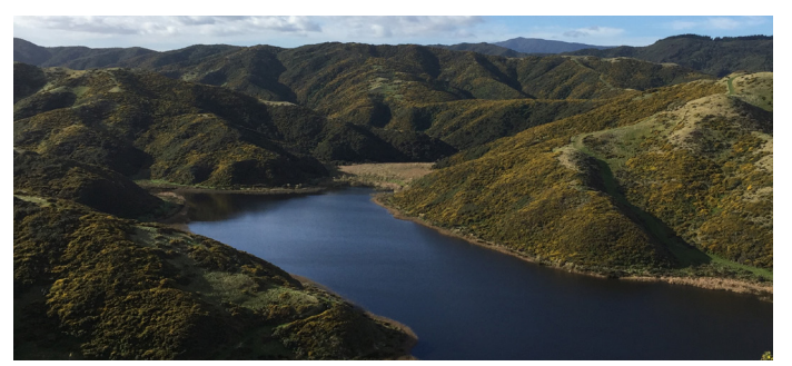
Lake Kōhangapiripiri 2019 where passive restoration supported by planting plots since 2007 by MIRO (with Greater Wellington and Taranki Whānau support). The process of allowing the bush to restore naturally has been supported by pest plant and animal work and a fire management plan is in place.