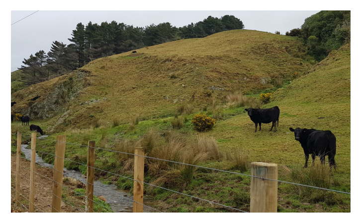
Less stock will mean less investment of funds in fences and gates and cleaner streams.