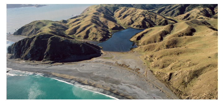
Lake Kōhangapiripiri (2004) is fed by Camerons Creek from the north and enclosed by the shingle beach to the south.

The Lakes contain Gollans wetland and Cameron's wetland which are extensive ecosystems; largely intact and support a wide variety of native aquatic plants, fish and birds. The areas of coastal cliff, coastal platform and shingle beaches are important for breeding shorebirds, reptiles and rare cushion plants. There are remnant forest patches and throughout the park native vegetation is regenerating passively, supported by an annual planting programme and ongoing pest plant and animal reduction work.