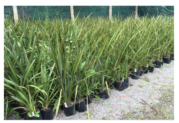
Queen Elizabeth Park nursery where thousands of trees are grown each year to help restore the park.