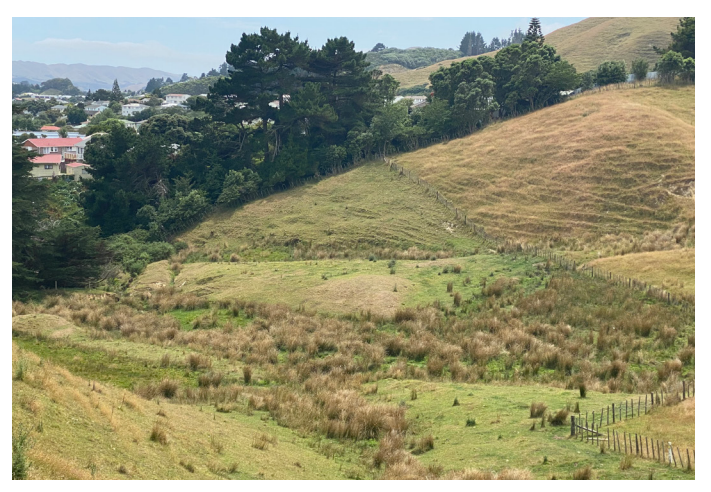
Less than 3% of the regions wetlands remain and they are important habitat, natural filters and great places to listen to frogs and watch birdlife. Greater Wellington wants to showcase best practice in land care and wetland restoration.