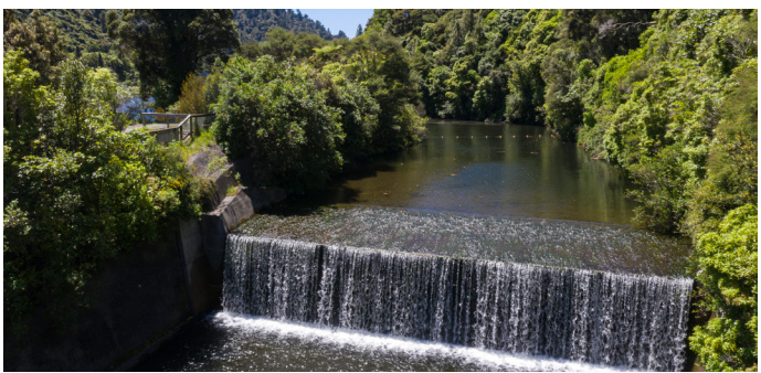
Lower Dam, Wainuiomata Reservoir, 1888