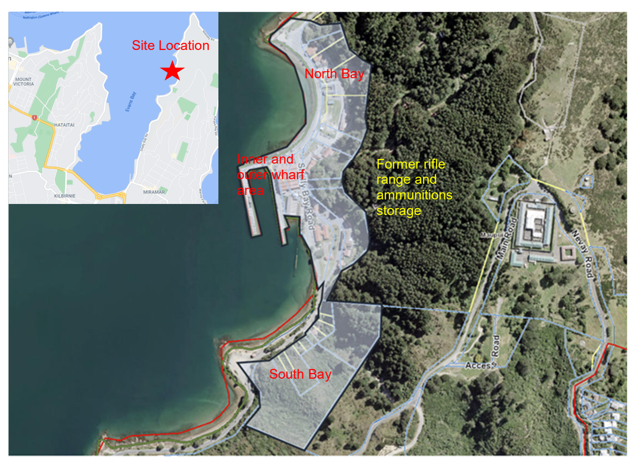
Figure 2-1 Site Location Plan

The development will include demolition of all buildings on the Site with the exception of the two west of Shelly Bay Road, and earthworks involving cut and fill for levelling of building platforms and landscaping. A number of residential and commercial units are proposed with the building outlines demonstrated in the master plan, Appendix B.