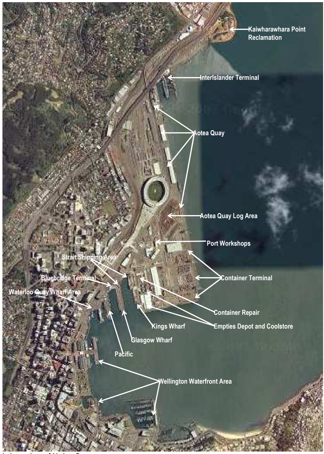
Figure 1: Location of Noise Sources