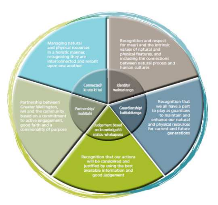
Figure 1: Principles used to guide decision-making during the development of the proposed Plan