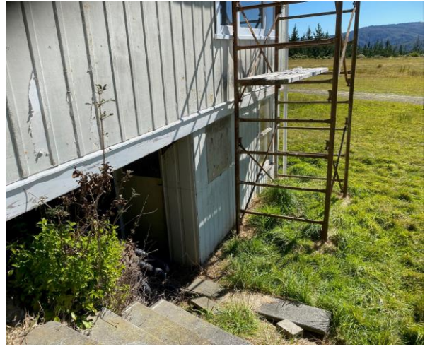
There is a generator shed beside the hangar. There is a storage room underneath the club hut, at full ceiling height.