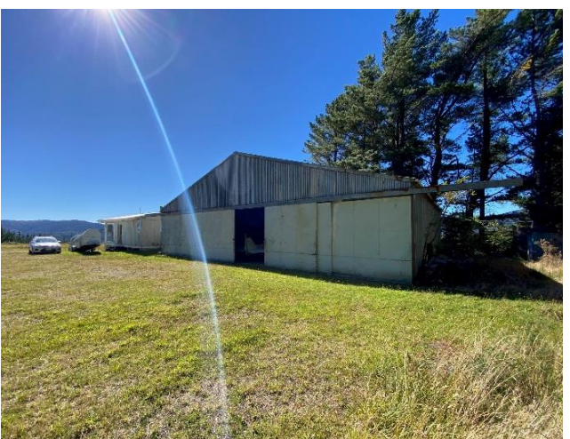
Former glider club hut and hanger. Both require extensive upgrade and consenting works before they can be reused for other compatible park purposes.