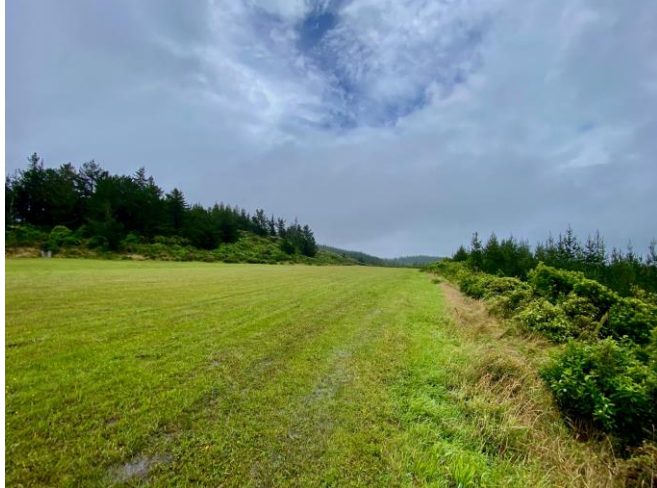
The former glider club licence area includes a runway and two club buildings. We are seeking interest in appropriate new of these buildings to enable them to be recycled and avoid demolition.