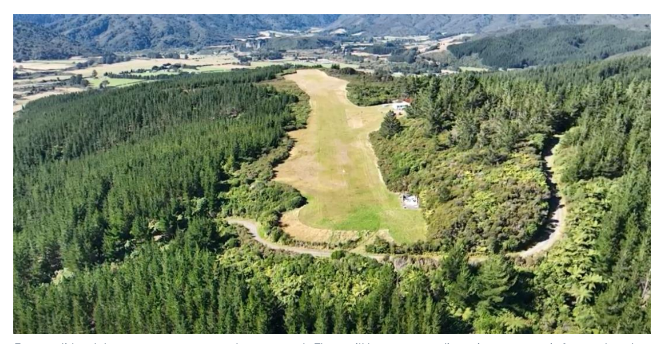
Former glider club runway open space and access track. There will be temporary disruption to access in future when the surrounding plantation forest is harvested.

We welcome your questions. Please email <a href="mailto:parksplanning@gw.govt.nz">parksplanning@gw.govt.nz</a> or come along to an open day if one is organised. You can also phone the Pākuratahi Park Ranger via our Contact Centre - 0800 496 734.