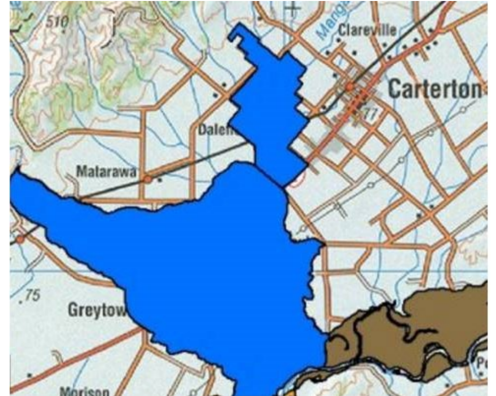
Blue – Mangatarere scheme Brown – Gladstone scheme